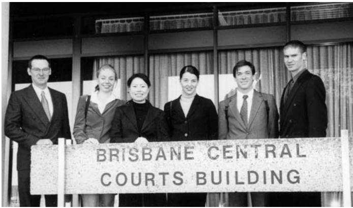
Griffith Legal Centre students pose for a happy snap after completing court appearances

In 2001, Griffith University Law Faculty ran four clinical programs. The clinical subjects (with the number of students who will participate) are: