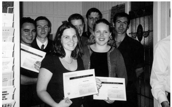
Griffith Advanced Family Law - Clinic students with their Certificates of Completion.

At the conclusion of each of these subjects, the students complete written evaluations of the subject and the teacher.