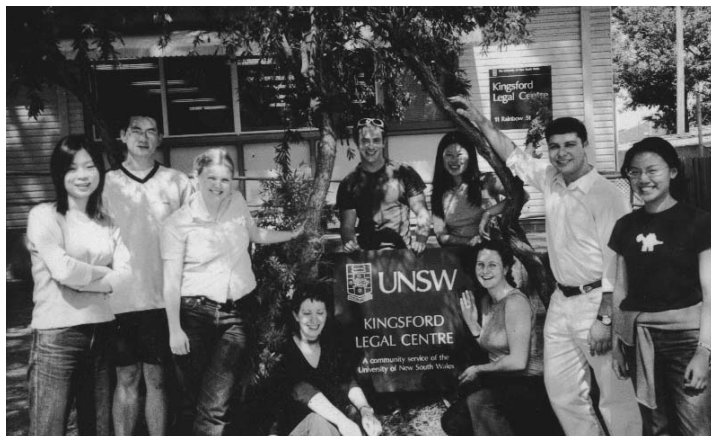
UNSW Clinical Legal Experience and Clinical Program - Employment Law students outside Kingsford Legal Centre.

The University of New South Wales Law Faculty offers five courses containing a formal clinical component. These are: